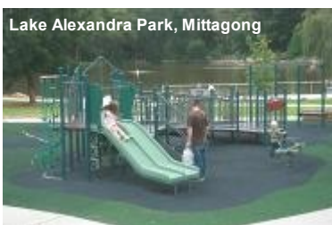
Lake Alexandra Park, Mittagong

If you haven't got all the information you need about this program go to: http://www.infrastructure.gov.au/local/rcip_guidelines.aspx