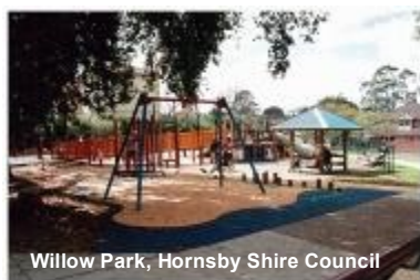
Willow Park, Hornsby Shire Council